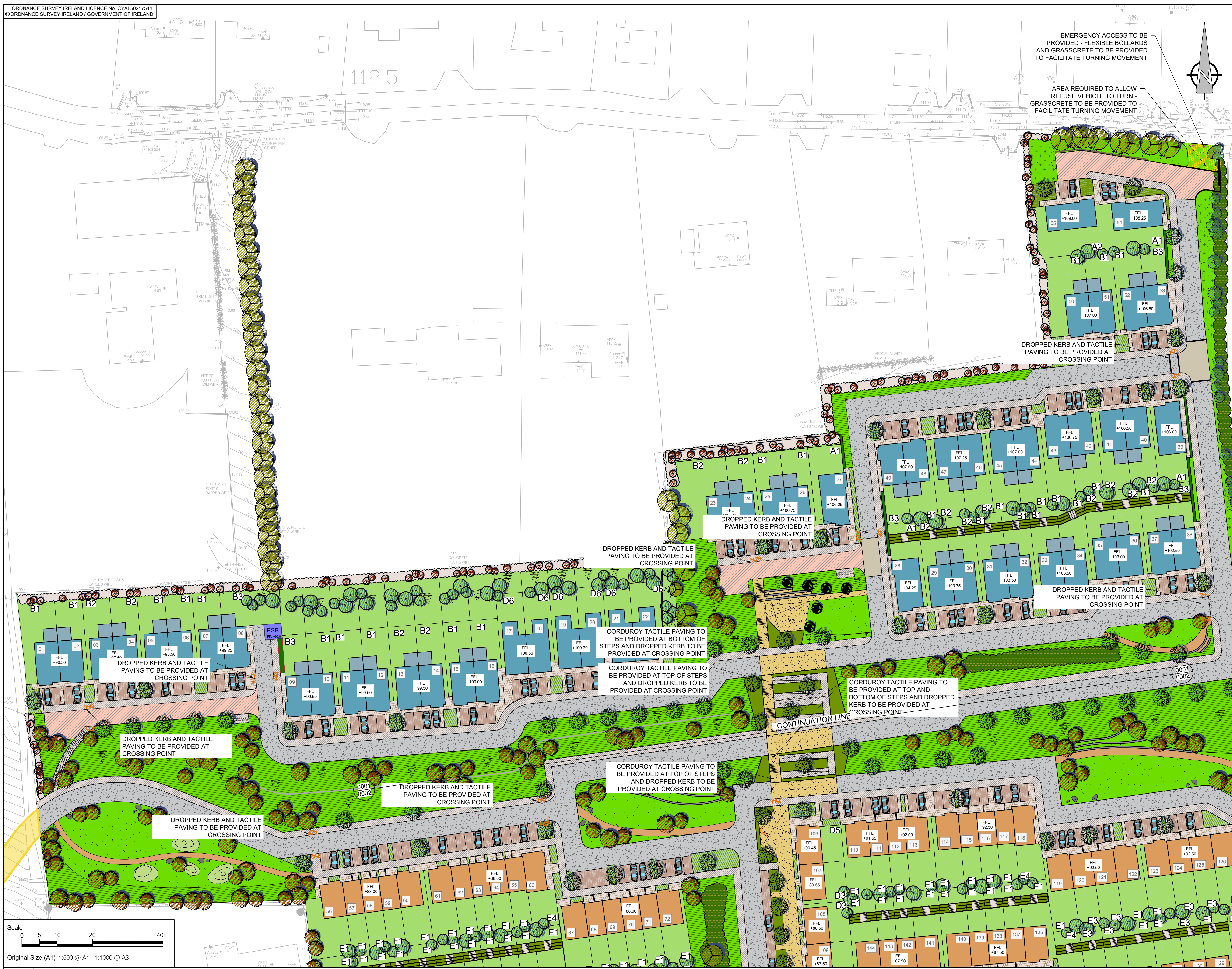
A PROPOSED GENERAL ARRANGEMENT 0001 Scale: 1:500

Project Management Initials: Designer: MC Checked: AP Approved: EMcK ISO A1 594mm x 841mm Last saved by: AILEEN PRENDERGAST (2021-11-25) Last Plotted: 2021-12-03 Filename: I:\EUROCOM\NET\COM\KIEB\Z\JOBS\IPR-333515_3_GLOUNTHAUNE_PHASE_2\900_CAD_GIS\904_CEO1_WIP\02_SHEETS\0592432-ACM-00-00-DR-CE-10-0001.DWG